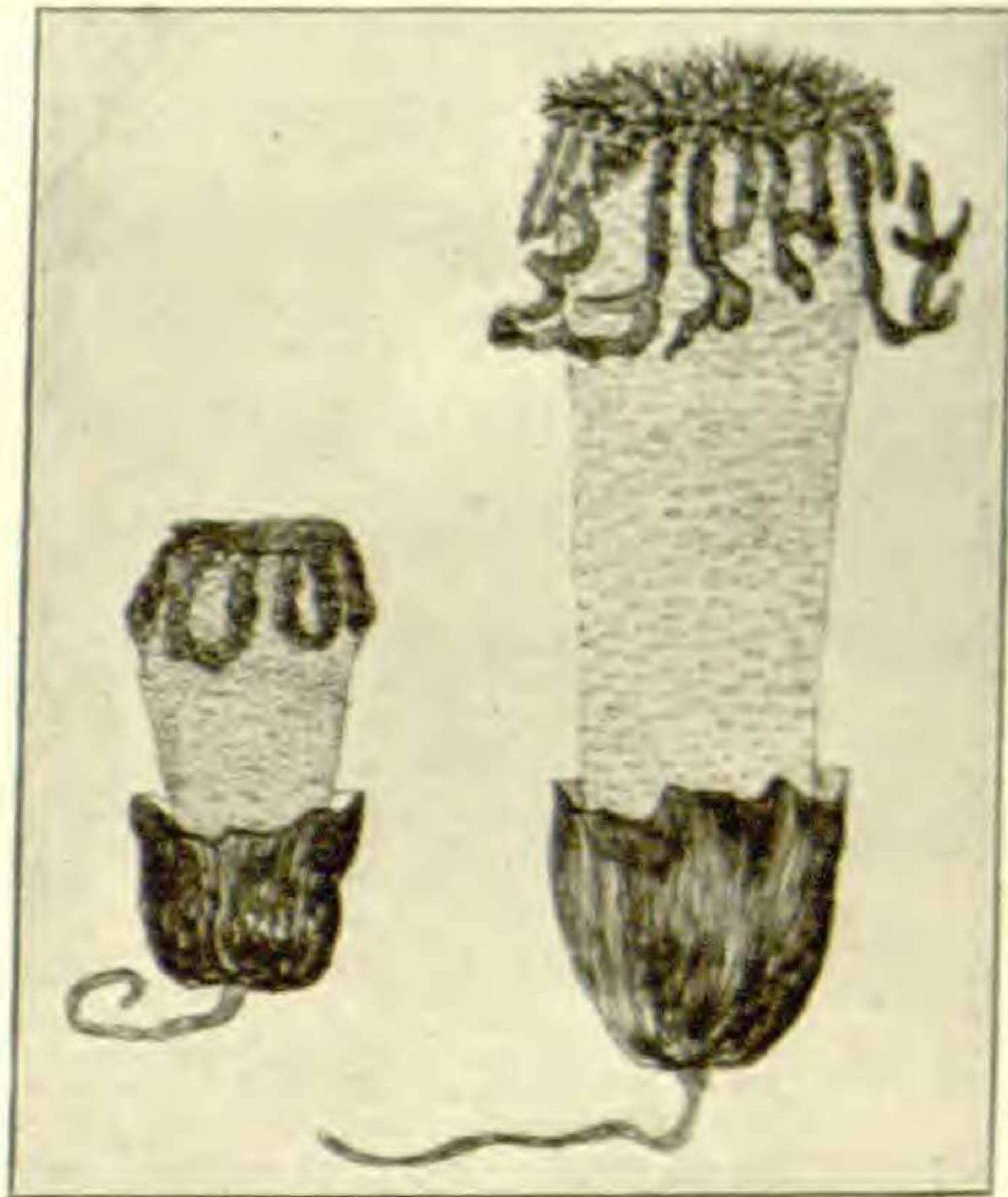
FIG. 3.— Dictybole texensis .

Dictybole texensis Atkinson & Long, n. sp.—Plants subterranean, emerging by the elongation of the receptacle, 7–10 cm high. Receptacle nearly cylindrical, slightly tapering downward, cream white, firm; pileus not perforated at the apex, usually pendent from apex of receptacle, and upper part of volva often in contact. Gleba at first drab, then black; sterile plates in upper part of gleba numerous, short, and narrow, arranged in a more or less radiating and imbricated manner; latticed portion with large oblong rings (8–16?), the surface rugose, and in age loosening out into a large open, irregular mesh. Spore bearing tissue between the sterile plates and lying between and over the lattice work. Spores pale olive brown, irregularly oval, 3-4 \times 2-3 \mu , smooth. Volva large, white, circumscissile, rooting at the base. The plant when fresh has a pleasant but strong “amyl-acetate” odor.—In sandy soil. Denton, Texas.